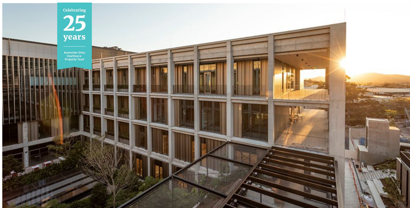
Surgical Treatment and Rehabilitation Service (STARS), Herston, QLD, Herston Quarters, QLD