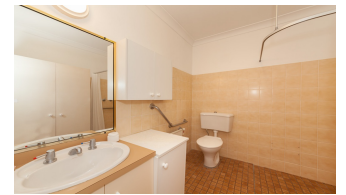
Serviced Apartment 211