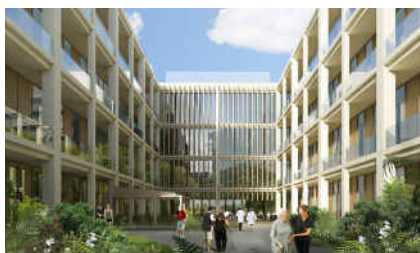
Artists impression of the new SRACC courtyard