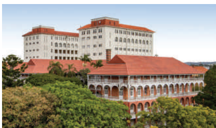
Lady Lamington Buildings