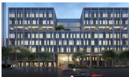
Artist impression of the Herston Rd Elevation

Australian Unity's masterplan includes many buildings on the site, including a number of heritage buildings.