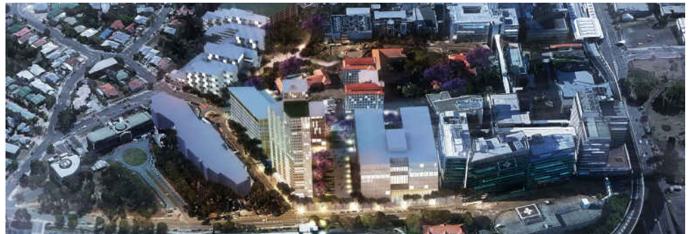
Ariel view of the site