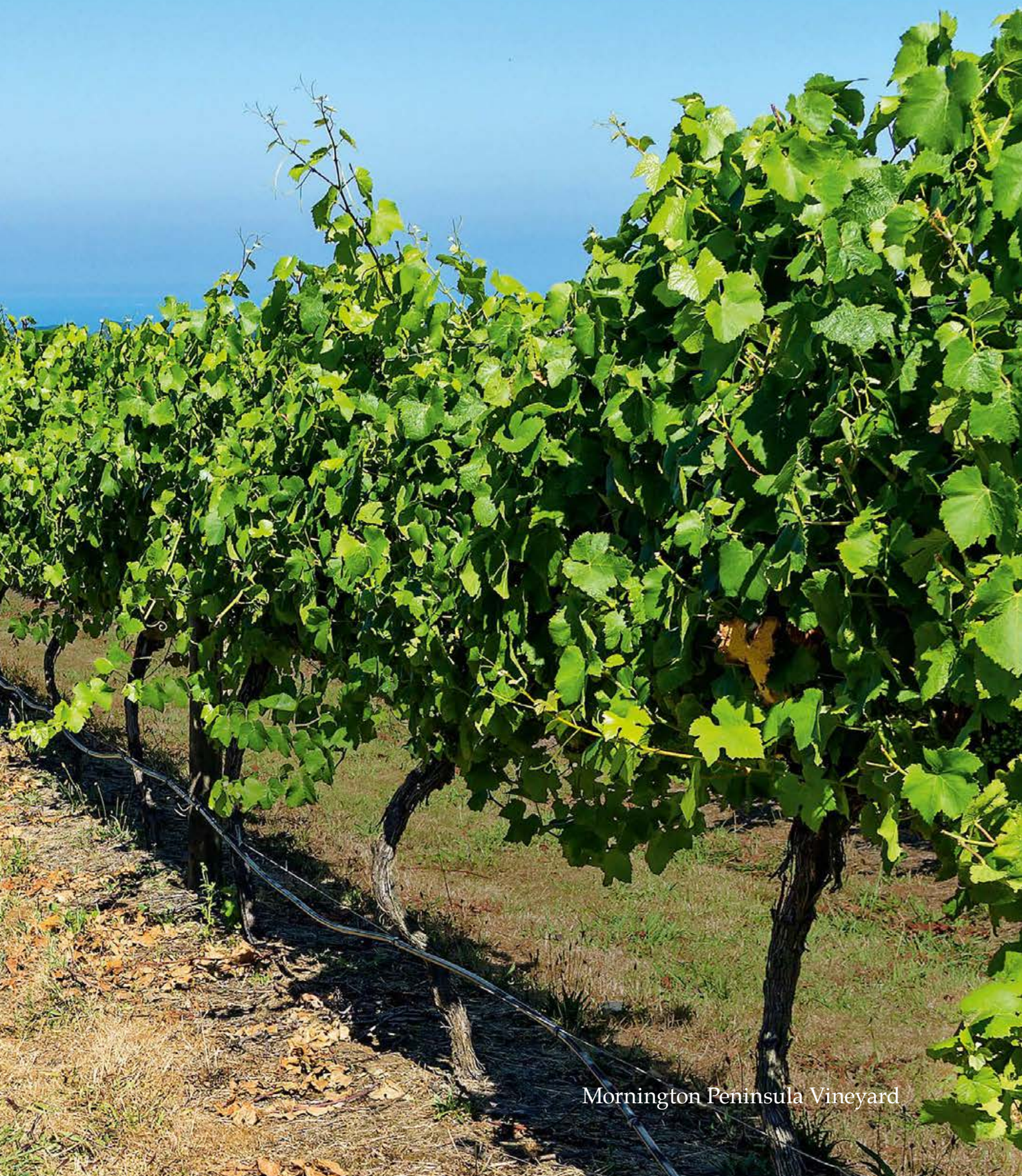
Mornington Peninsula Vineyard