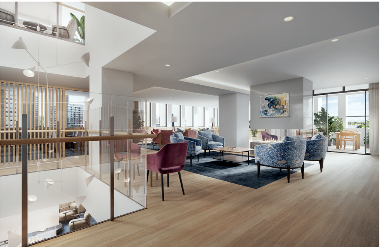
Residents' lounge. Artist's impression.

Suites at The Alba are visionary in design featuring the small household model, to make you feel right at home. Each self-contained household has its own kitchen, dining room and living room. Comforting, familiar spaces like those you'd find in any home. This model of care enables you to participate in household life, including meal preparation, and allows for you to make decisions on the rhythms of your daily routine. Community is paramount, with opportunities for companionship and connection in a stimulating environment. You will always feel safe and secure, with discreet security measures in place. Our innovative and forward-thinking design harnesses new technologies that will benefit you, while incorporating sustainable solutions that allow us to work towards a better future.