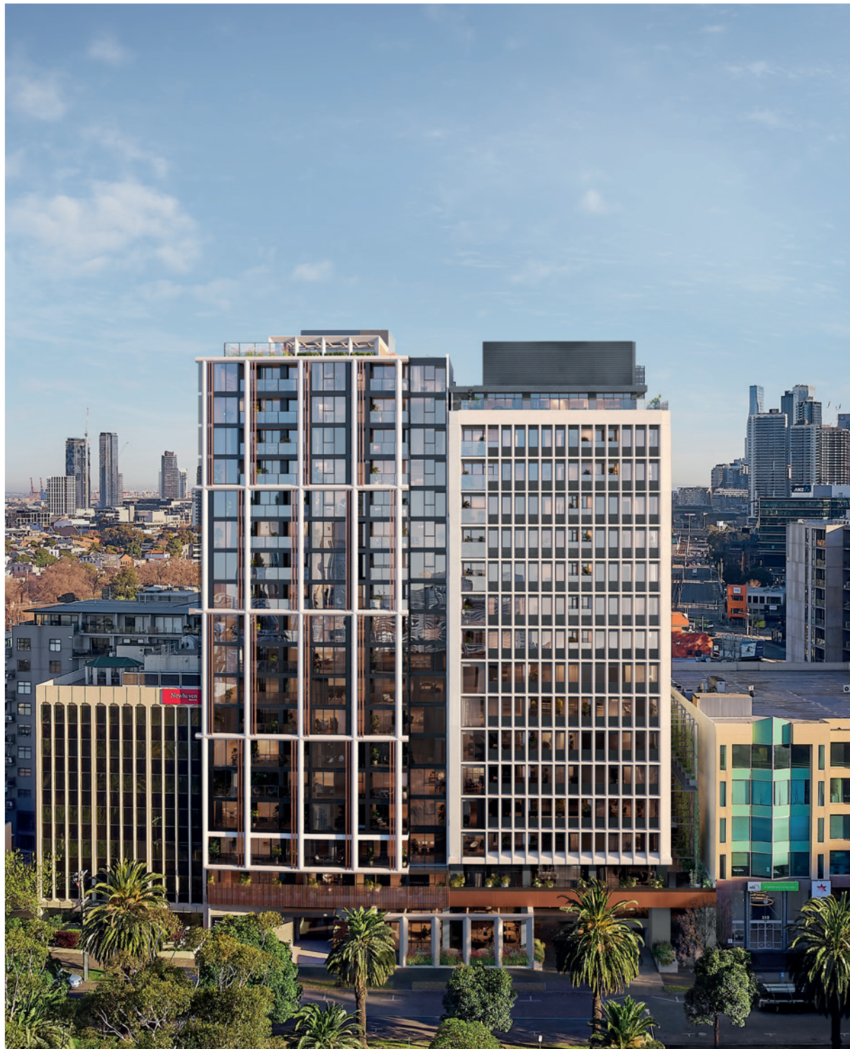
The Albert Park Lake precinct. Artist's impression.