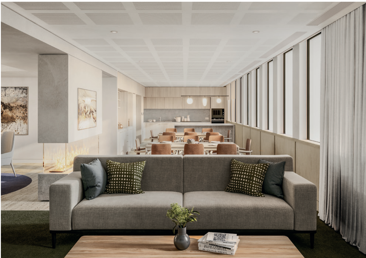
Lounge and dining area. Artist's impression.