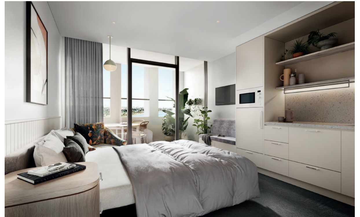
Suite at The Alba. Artist's impression.