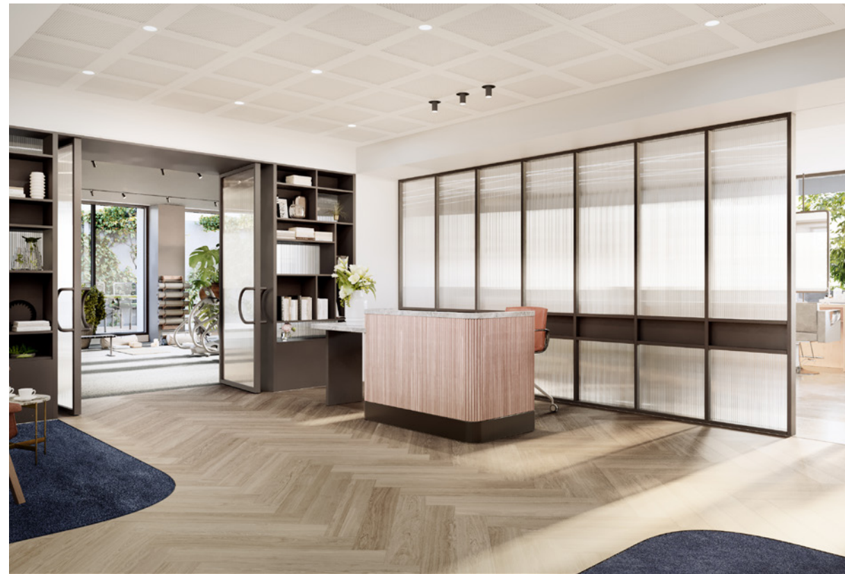
Wellbeing Studio, level one. Artist's impression.

At Australian Unity, we're for Real Wellbeing — which means we recognise how important eating well is to a healthy life. At The Alba, you'll enjoy nutritious and delicious daily meals which are all prepared onsite by our chefs. Choose from a variety of fresh, seasonal meals, which are sure to delight your tastebuds. As each household has its own beautifully appointed kitchen, you can cook your own meals, too. The well-stocked pantry is replenished each day with fresh produce and, if you need assistance with cooking, your care companion is here to assist.