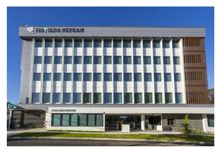
Matilda Nepean Private Hospital, Kingswood, NSW