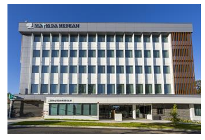
Matilda Nepean Private Hospital, Kingswood, NSW