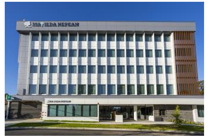
Matilda Nepean Private Hospital, Kingswood, NSW